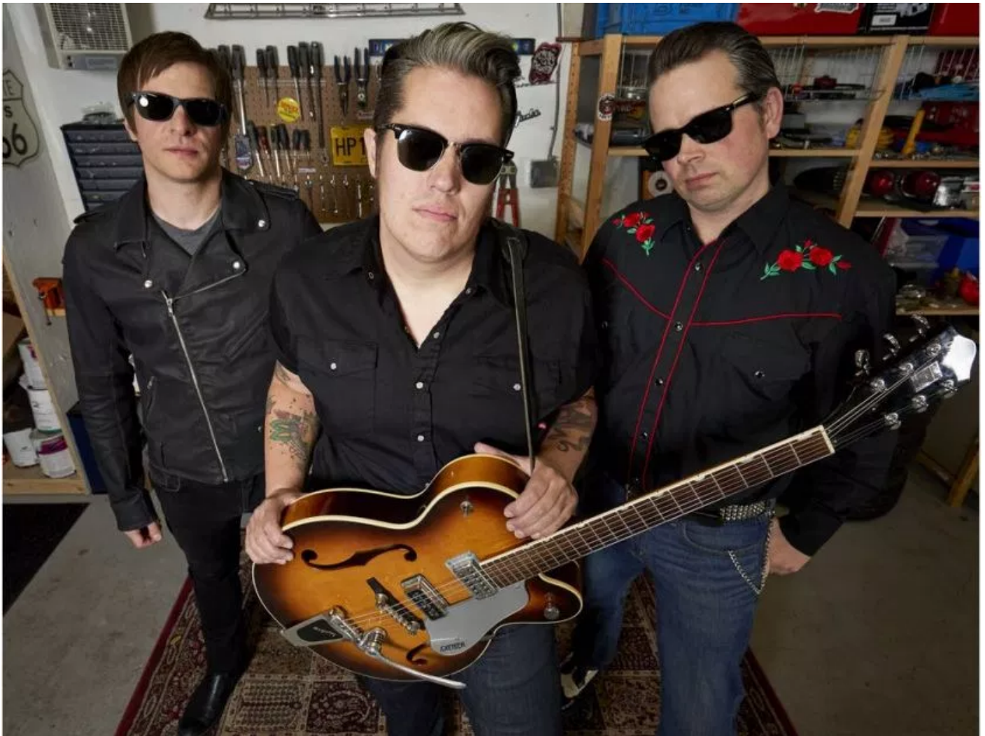
The Confusionaires perform at the Aviary on Saturday night.